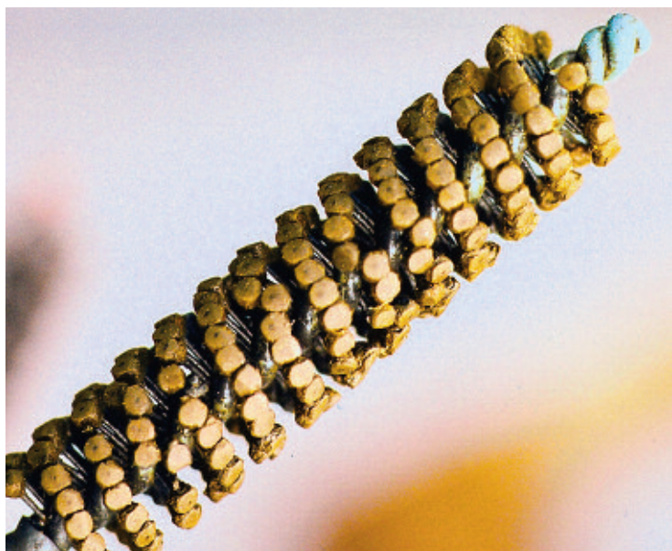
As the Flex-Hone is turned in the bore, the individual abrasive balls wear down.